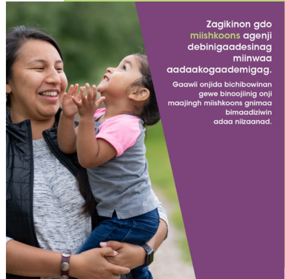
Pictured above: An example of available content. Text is written in Ojibwe.